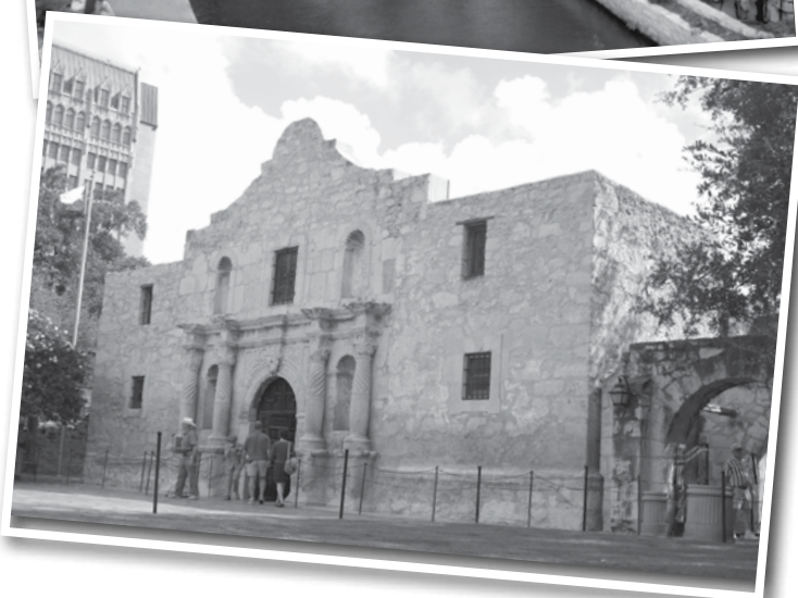
The Riverwalk and The Alamo in San Antonio